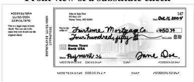
Front view of a substitute check